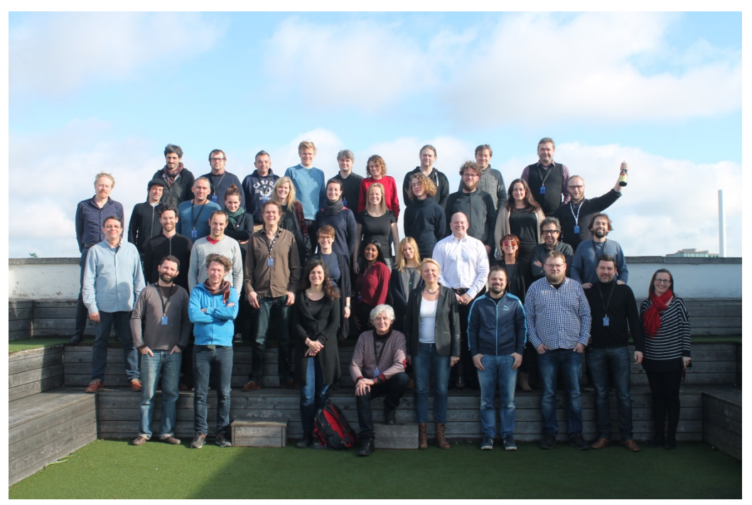
Lighthouses team in Copenhagen from 3rd to 5th march 2015

This seminar was focused on the venues strategies to involve the audience and the volunteers. Why and how does it make sense to involve the users? What does it really mean? What are the effects and the challenges? Engaging users create a value through interaction because mutual values are shared. Why is it so interesting the organisations? Why it makes sense for the users?