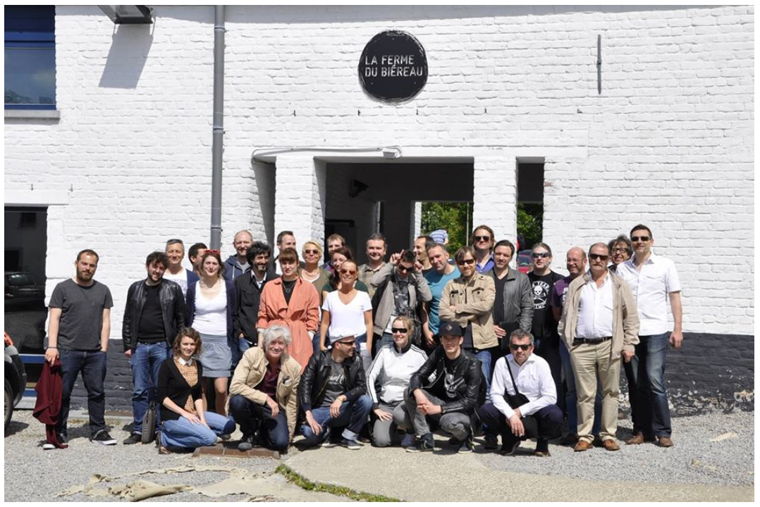
Lighthouses team in Brussels from 11th to 13th may 2015

This seminar dealed with the artistic contracts legislation. In a globalised system, venues bookers have to deal with foreign stakeholders and deal with different rules and habits regarding the contracts and the costs. Concerning this point, there is no uniformed European legislation, and the national regulation can be different. Moreover, some parts of the agreements are not ruled by the law and are based on trust and habits. The purpose of this seminar was to learn about the most important rules from each country and exchange about the bookers' practises.