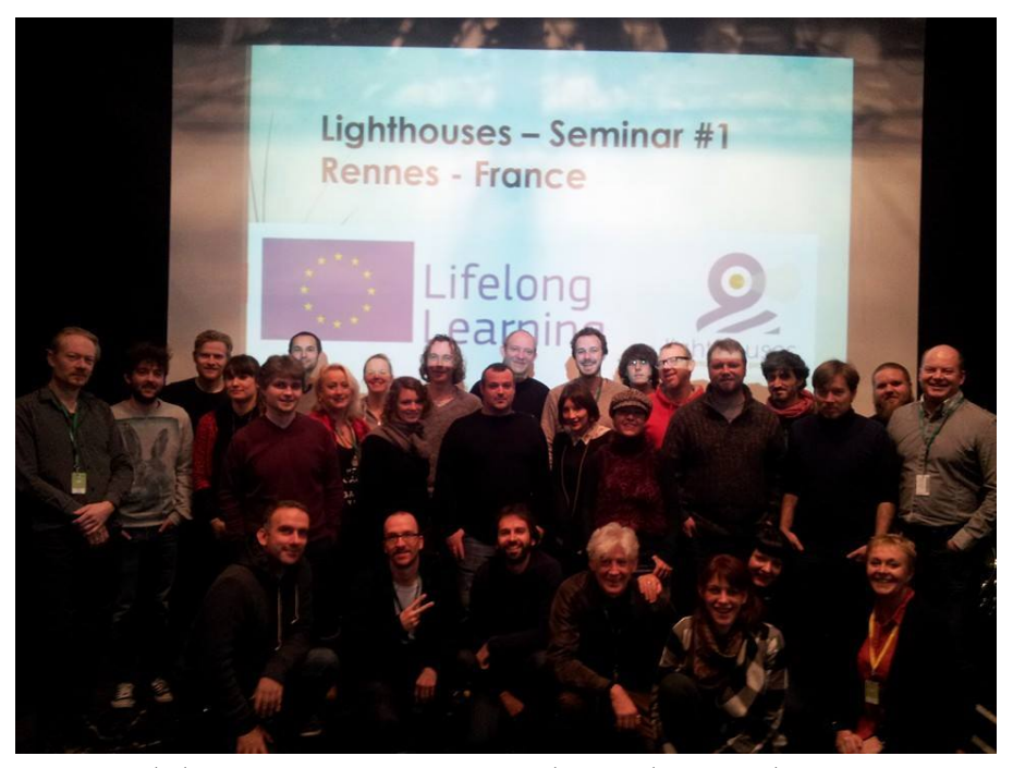
Lighthouses team in Rennes, 4th - 6th December 2013

This introductory seminar was an important start of the activities of the Lighthouses project. Its first aims was to get the participants to know each other's and to begin to work together about artistic programmation. This first seminar gathered 31 european professionals of the music sector, coming from Belgium, Denmark, Spain, France, and Netherlands. All these people are working in live music venues, and are in charge of the artistic programmation, the venues represented are both in rural and urban area, and are both small of big venues. The interest of that, was the