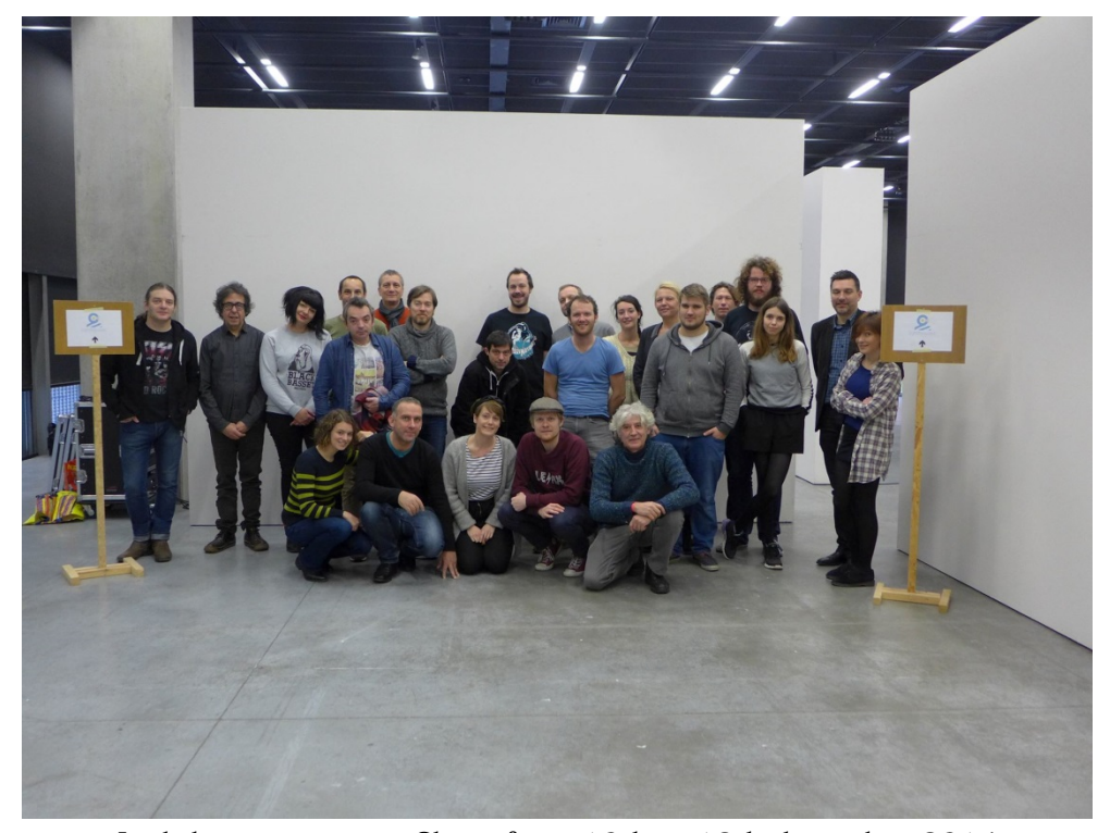
Lighthouses team in Ghent from 10th to 12th december 2014

This seminar was focused on ticketing systems and the strategies concerning the relationship with the audience regarding tickets sells. 30 professionals and coordinators joined this seminar. It was organised by the Flemish organisation Club Circuit and took place in Ghent, a medium-sized city in Flanders, during Glimps Festival. Glimps Festival is a show case festival that encourages emerging bands and takes place in music venues and cafes in Ghent's center town. This partnership with Glimps enabled a good cohesion between